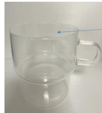
1: direct food contact