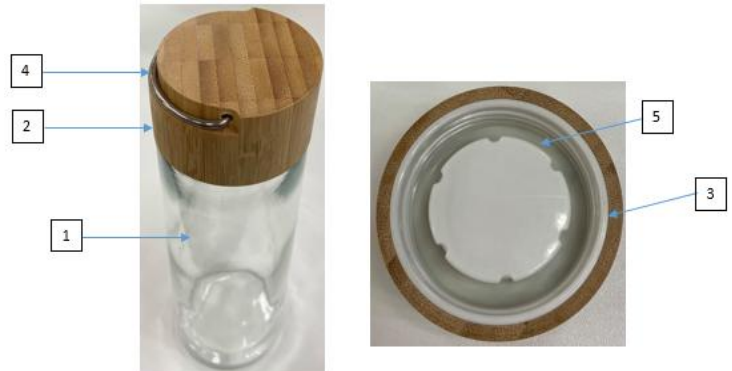
1, 3, 5 : direct food contact

MOB / MO6413 PO BOX 644 6710 BP(NL) PO41-XXXXX Made in China