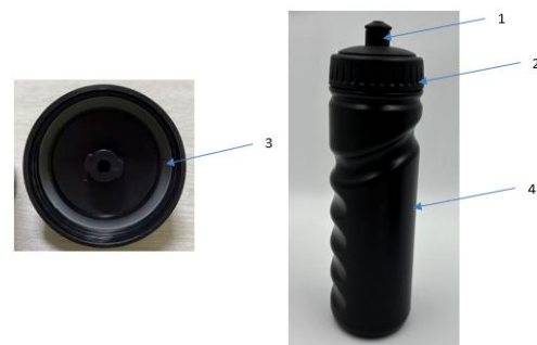
1, 2, 3, 4 : direct food contact

The following substances subject to restrictions and/or specification are used in the above-mentioned product. The materials and raw materials used comply with Regulation (EU) No 10/2011.