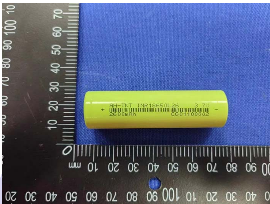
Photo 1 Front 正面